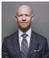
Managing Director & Portfolio Manager