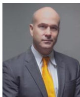
Managing Director & Portfolio Manager