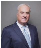
CIO & Managing Director