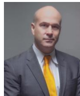
Managing Director & Portfolio Manager